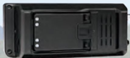
BP-272 attached (Rear panel view)

The BP-272 Li-ion battery pack comes with the IC-705. This is the same battery pack used in the ID-51 and ID-31 handheld transceivers. Of course, a 13.8 V DC external power supply can be used, too.