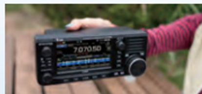
One hand holdable package

"Base station radio" performance and functions are packaged in a compact size of approximately 20 cm, 7.9 in (W) x 8 cm, 3.1in (H) x 8.5 cm, 3.3 in (D). The weight is approximately 1 kg (excluding battery pack and antenna). Its compact and lightweight design enables you to hold it with one hand.