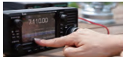
Touch screen display

The large 4.3 inch touch screen color display is the same size as the one used in the IC-7300 and IC-9700. It dramatically improves visibility and operability in the fields.