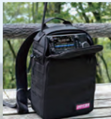
LC-192 Multi-function backpack

The IC-705 fits perfectly in the optional dedicated LC-192 multi-function backpack. It has various functions, such as holes for the antenna and holes for passing through coaxial cable and microphone cable. You can easily operate the IC-705 with it in the backpack.